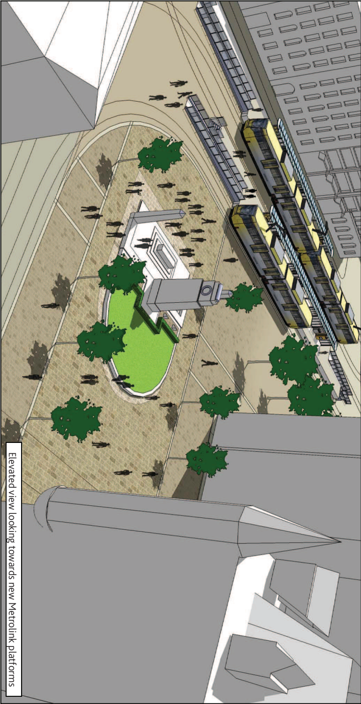
Elevated view looking towards new Metrolink platforms