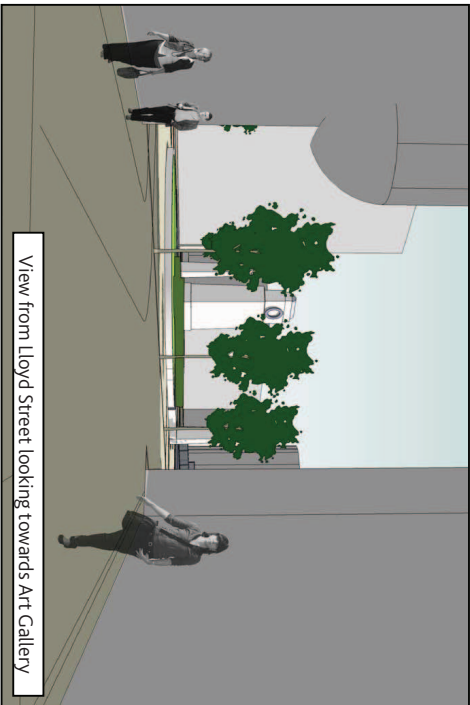
View from Lloyd Street looking towards Art Gallery