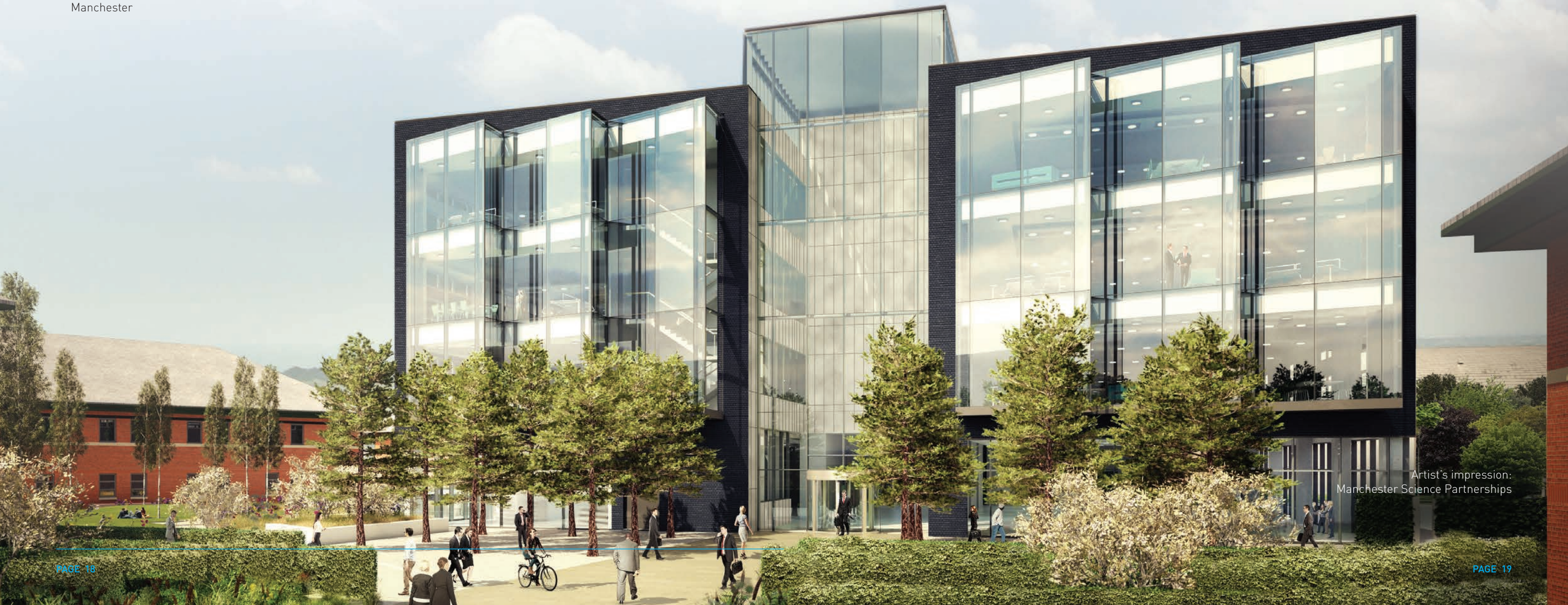
Artist's impression: Manchester Science Partnerships