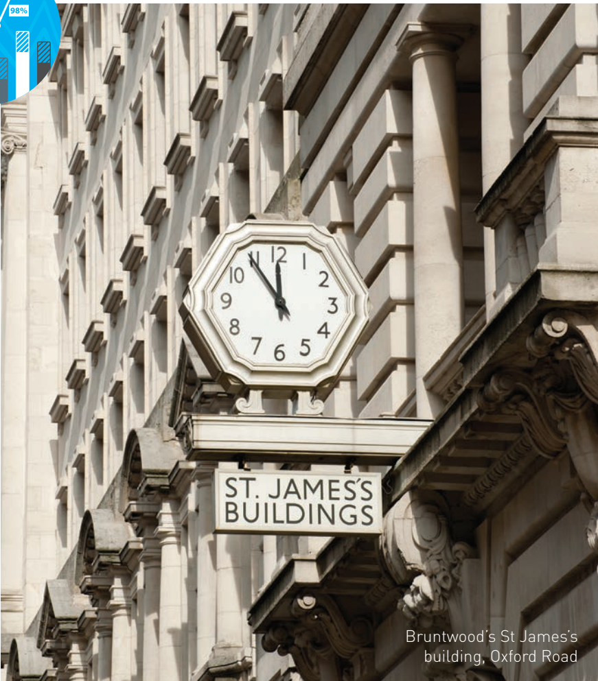
Bruntwood's St James's building, Oxford Road

Corridor Manchester's latent economic potential is considerable. It has a leading role to play in technology, media and telecoms companies, as well as science-based companies; particularly bio-health. Increasing the contribution of the private sector to the Corridor Manchester economy is an important goal for the city and Corridor Manchester partners.