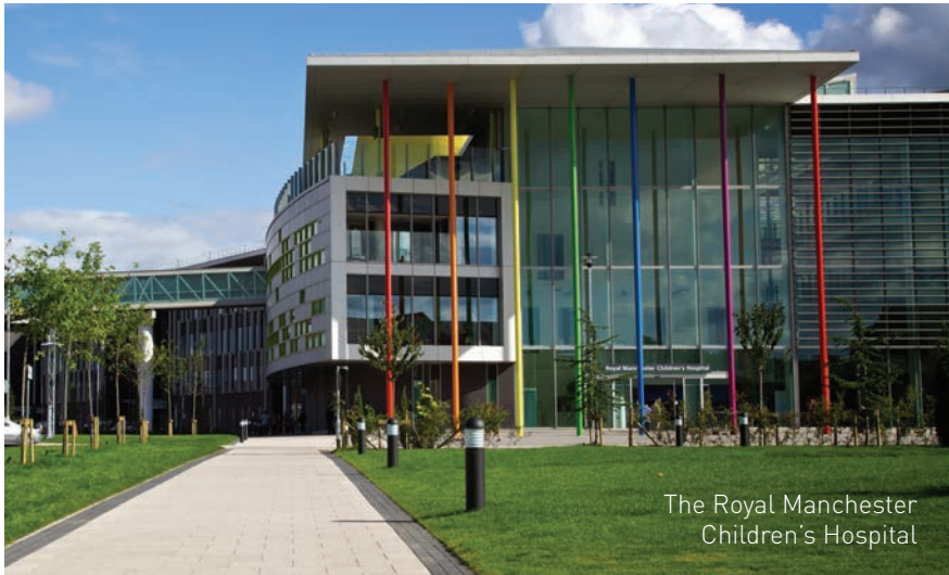
The Royal Manchester Children's Hospital

With a workforce of 60,000 and a regular turnover of staff, and the increasing attractiveness of the city as a place to live, there is increasing demand for a broader range of housing, including high-quality apartments for rent. The next 10 years will see new housing provision within Corridor Manchester linked to supporting the needs of a growing, younger and higher-skilled workforce. This development needs to balance the competing demands for space between commercial growth and residential offering, particularly concerning overall residential strategies for the city. Furthermore, it must create conditions that are favourable for development in terms of both working/ studying, living and leisure.