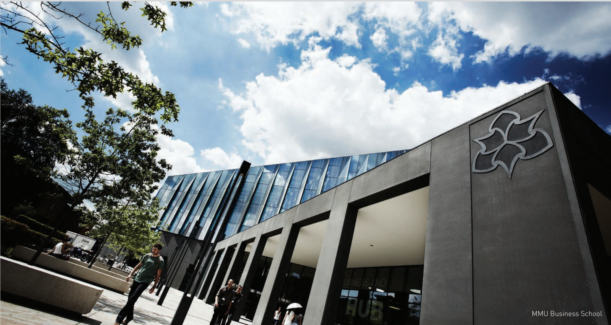
MMU Business School

The quality of the higher education campus has become one of Corridor Manchester’s distinguishing features, and planned investments will further strengthen this role. Manchester is now one of the most attractive destinations for home and international students, as well as a nationally important source of well-qualified graduates for the UK workforce; in particular, science and technology graduates, and health-related occupations.