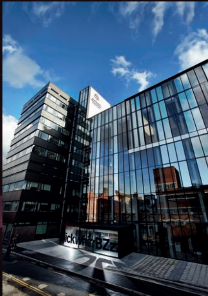
National Graphene Institute (NGI), Booth Street East

Increasing the contribution of SMEs to Corridor Manchester's economy is an important goal for partners, including attracting new SMEs keen to locate close to the expertise and talent pool of the leading institutions. In addition, it will be important to support micro-enterprise and new start-ups in areas such as creative, cultural and digital enterprises where Corridor Manchester has both important assets and the talent base to support many new businesses. It will be important to ensure the right mix of commercial accommodation and facilities are available to support businesses at every stage of the lifecycle, across our priority sectors, and to maximise the join-up between incubator spaces to pull networks of businesses together as a recognisable cluster.