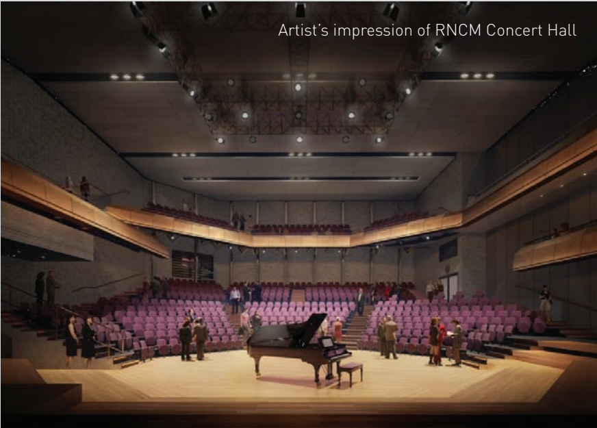
Artist’s impression of RNCM Concert Hall