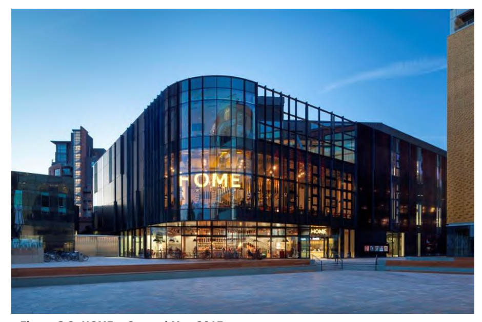
Figure 3.2: HOME - Opened May 2015

3.6 HOME forms the centre-piece of this cultural hub, supported by a range of complementary uses comprising: