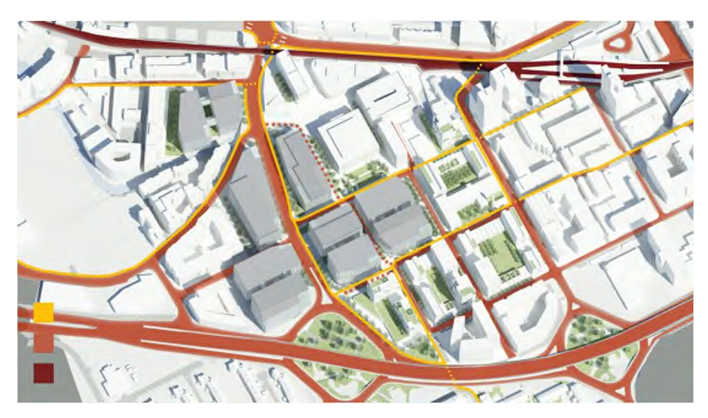
Figure 4.3: Vehicular Access and Circulation