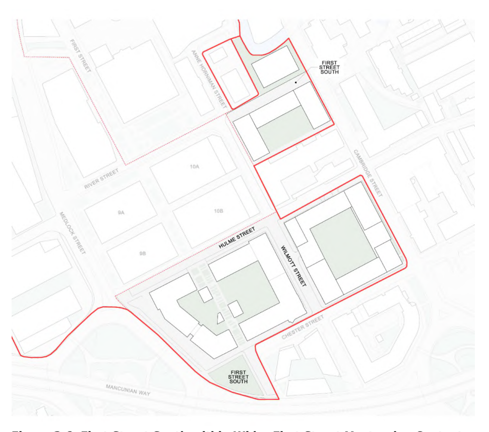
Figure 3.6: First Street South within Wider First Street Masterplan Context