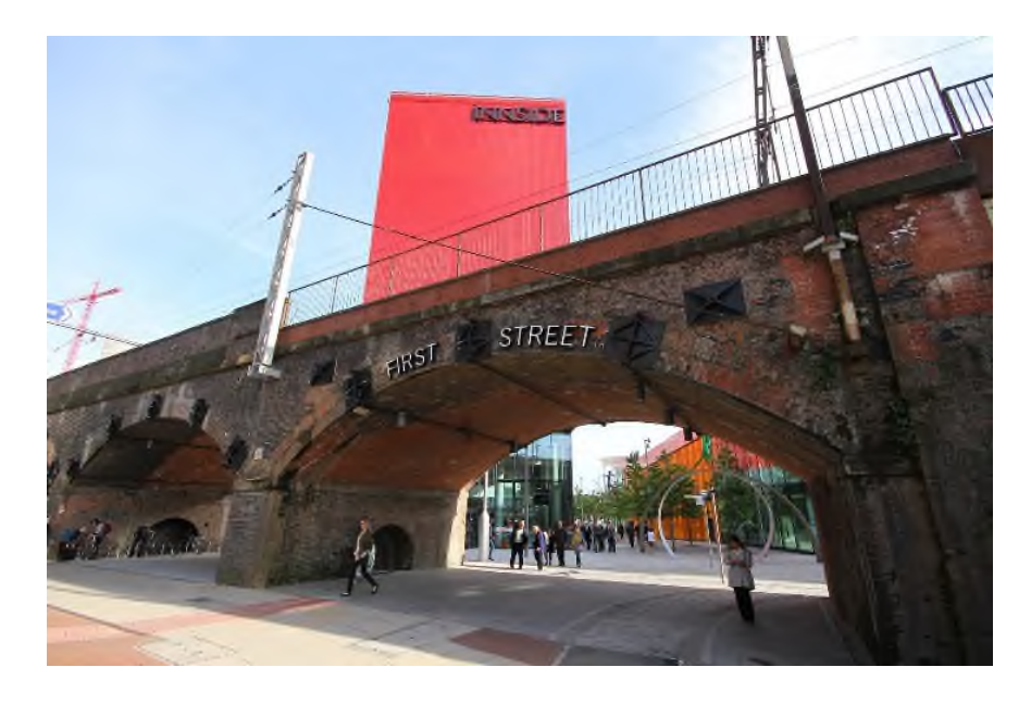
Figure 4.1: First Street