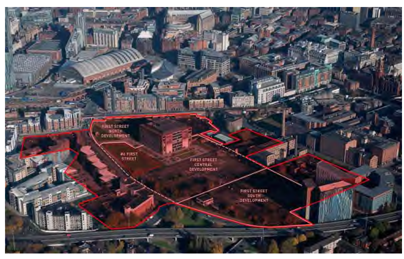
Figure 1.1 - First Street Development Areas