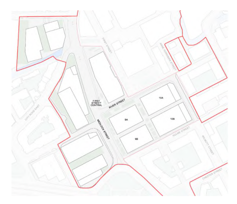
Figure 1.2 - First Street Central

16. First Street is now an established office location, demonstrating the success of its unique locational attributes within the City Centre and adjacent to the Corridor Manchester and distinctive offer of large, flexible floorplate Grade A office floorspace. Lettings secured to-date have created a critical mass of quality occupiers, fueling further demand and setting the conditions for exponential growth in the area.