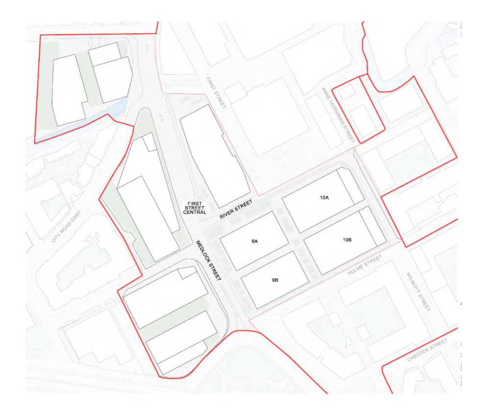
Figure 3.4: First Street Central within Wider First Street Masterplan Context

First Street Central comprises the central east-west core of the First Street area, immediately south of First Street North and incorporating the sites on the western side of Medlock Street.