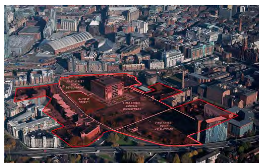
Figure 1.2: First Street Development Framework Masterplan Area 2015 and 2018

Street North, First Street South, and the Creative Ribbon remain unchanged from the 2015 Update.