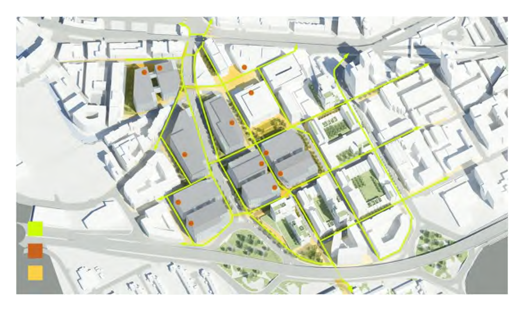
Figure 4.2: Pedestrian Routes and Connections

The primary vehicular entrances to First Street are off Medlock Street and Cambridge Street. These access points are connected by Chester Street, Hulme Street, River Street and Wilmott Street, forming a robust primary circulation system within the area.