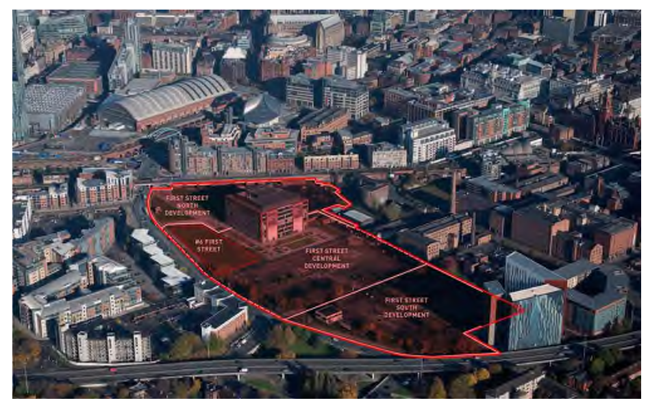
Figure 1.1: First Street Development Framework Masterplan Area 2012